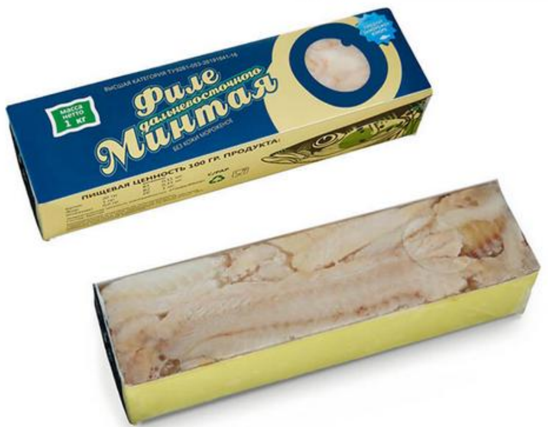
Food products showing price increases above the inflation rate of 14.30%